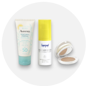
Acne & Skincare