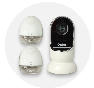
Baby & Mom